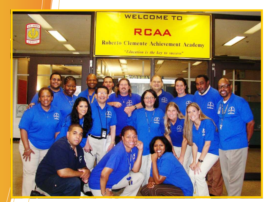
AA faculty and staff