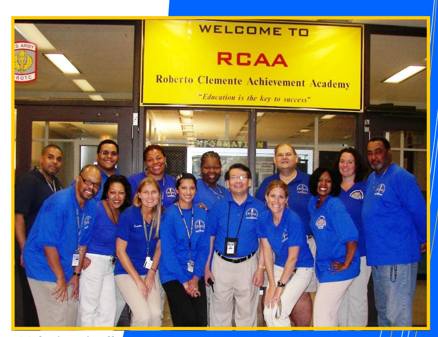
AA faculty and staff